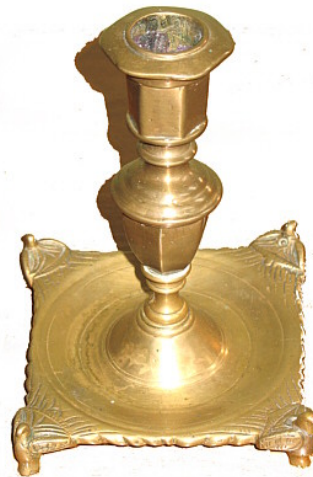
Early brass with an undisturbed patina should not be polished.

If your piece is lacquered, you can remove it yourself. Boiling smaller items in water mixed with baking soda is an old method