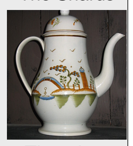
The whole pot